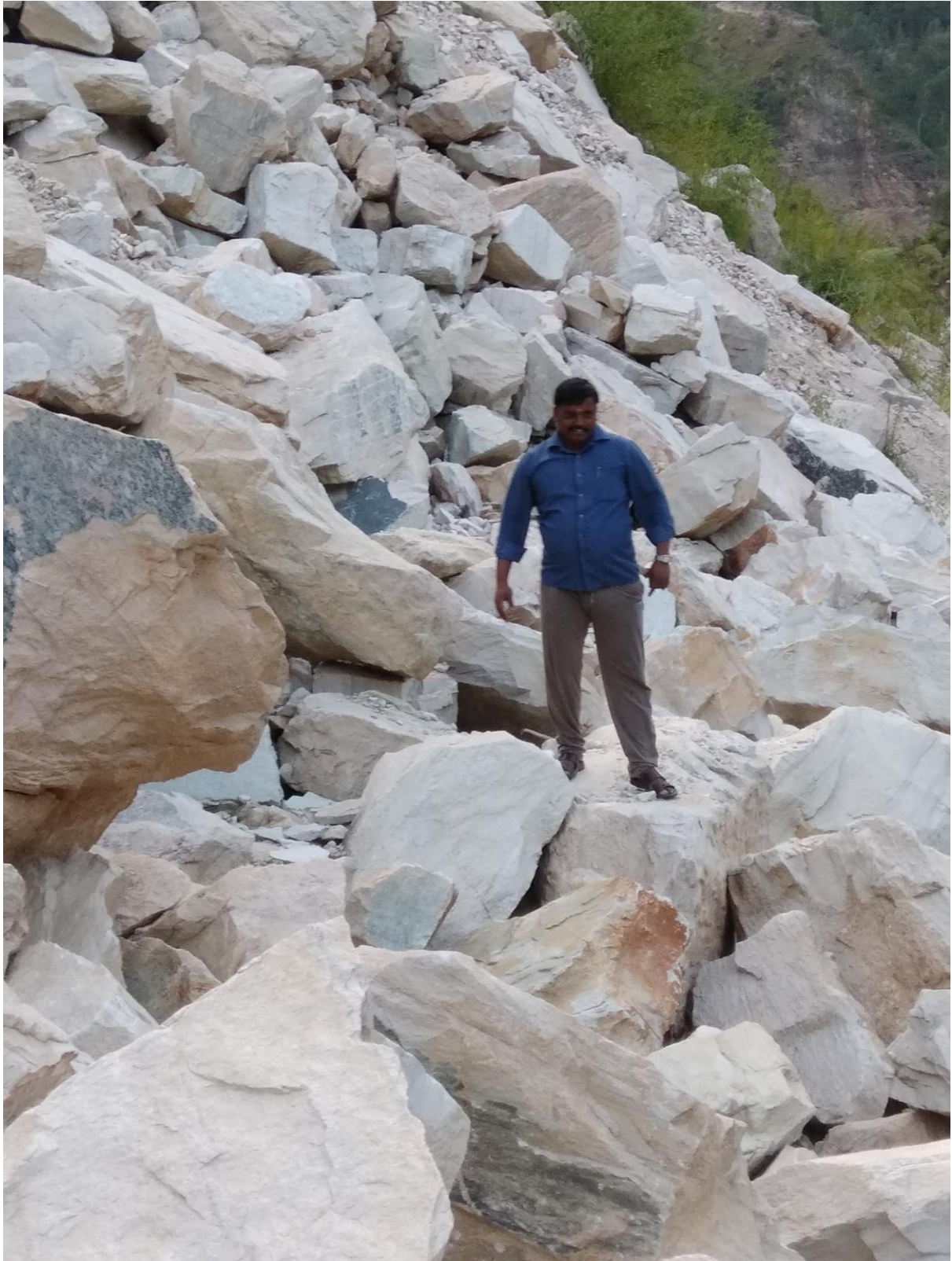
Filed work at the Jhakri landslide site indicating the dislodged blocks of rocks along the nearby slope at NH 22