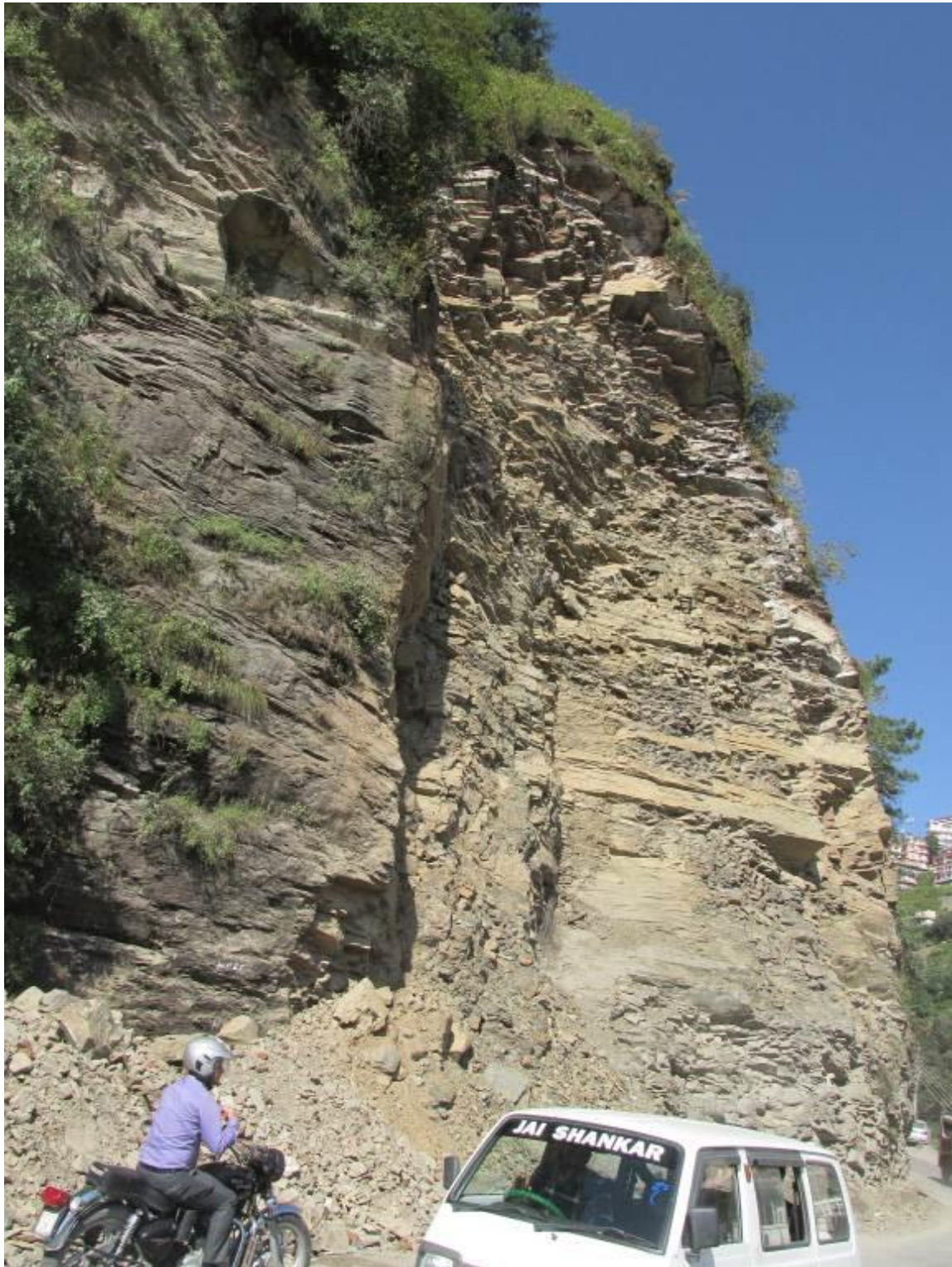
Exposed Slope surface of the Dhalli Rockslide indicating extensively jointed surfaces causing wedge failure