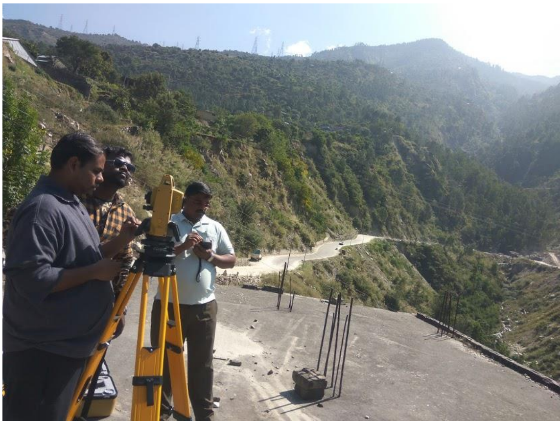
Field work indicating the contour mapping of the landslide sites along with the PhD supervisor and co scholar