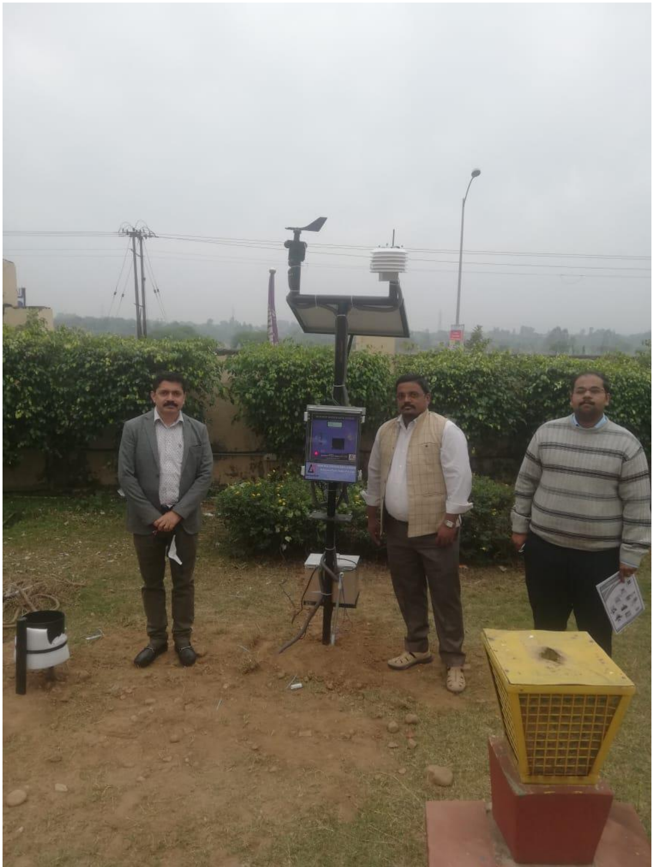
Installation of the autonomous landslide Early warning system as a pilot study with the Research guides